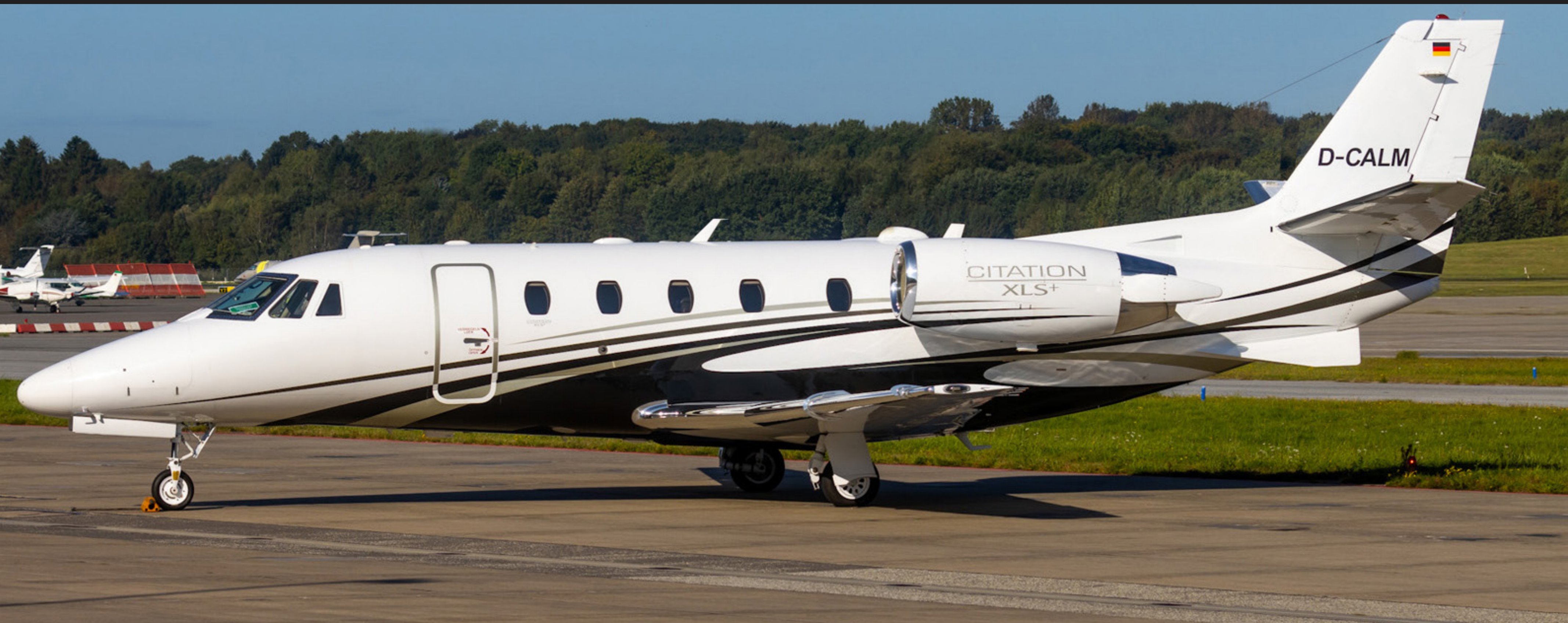
2012 Cessna Citation XLS+ SN 560XL-6129